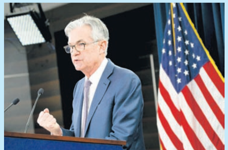
In this March 3, 2020 file photo Federal Reserve Chair Jerome Powell speaks during a news conference in Washington.

Treasury Secretary Steven Mnuchin, who also testified, came under sharp questioning from Sen. Elizabeth Warren, D-Mass., who charged that he wasn't doing enough to force companies that receive aid from the joint Fed-Treasury program to keep workers on their payrolls. "Will you require companies that receive money from this half-a-trillion-